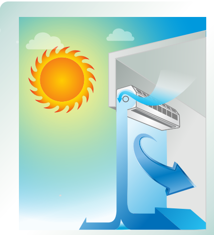
HEAT & HUMIDITY CONTROL