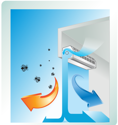
BUG & DUST CONTROL